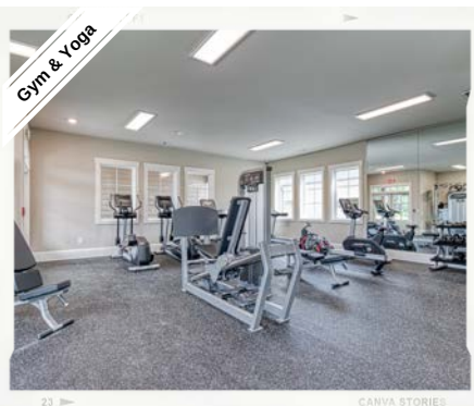
23 CANVA STORIES